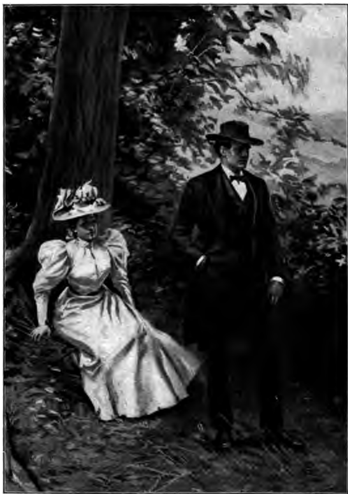
"He's in jail."